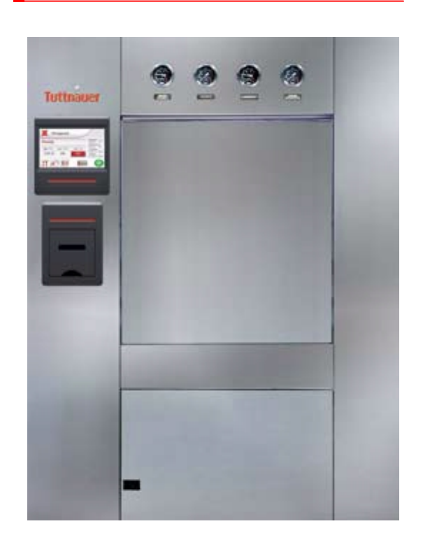
44 Compact Series with Vertical Sliding Door

Information furnished by Tuttnauer is believed to be accurate and reliable. However, no responsibility is assumed by Tuttnauer for its use.