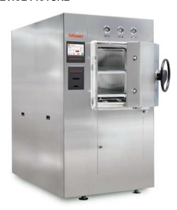
44 Compact Series with Hinged Door