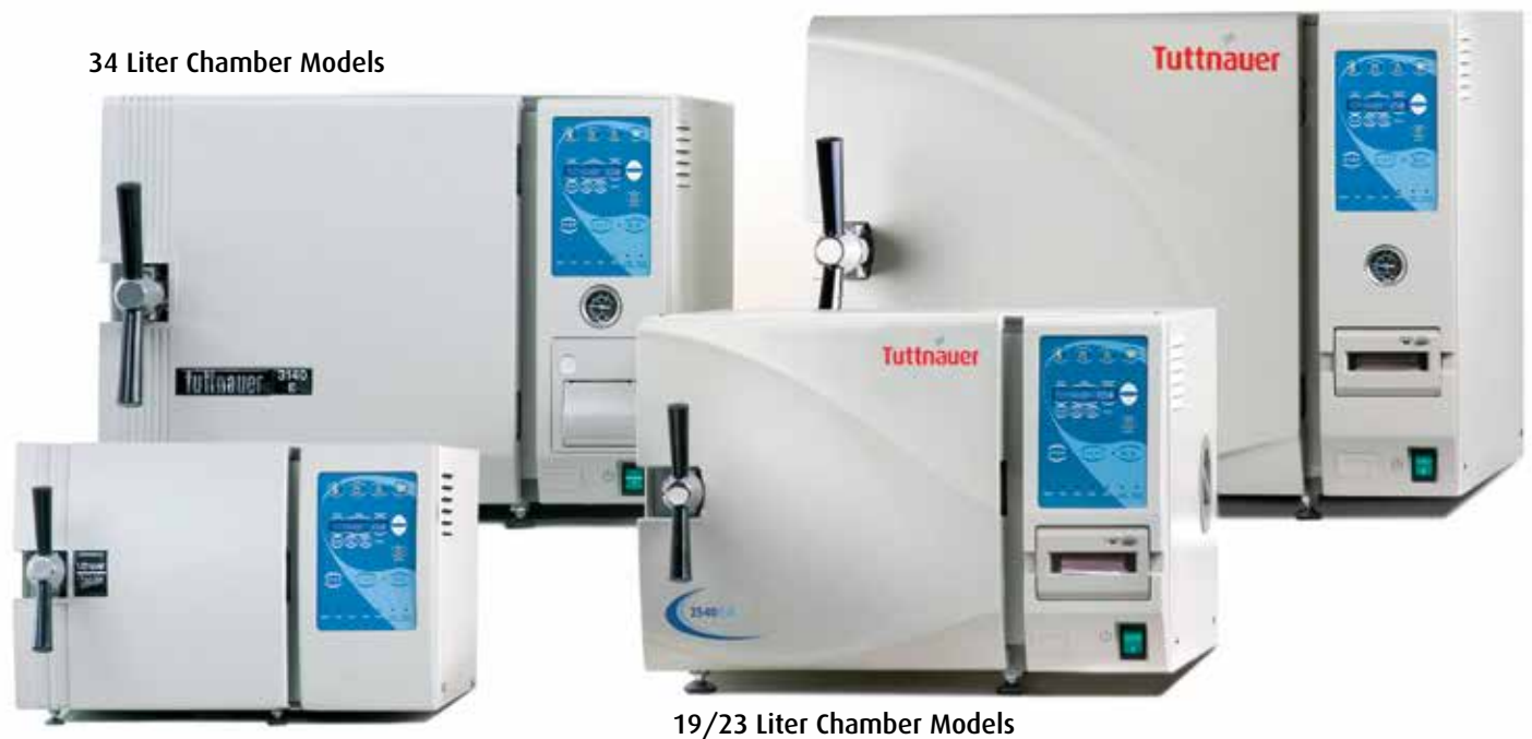
34 Liter Chamber Models