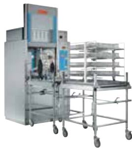
Washers/disinfectors for hospitals and laboratories