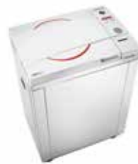
Laboratory autoclaves ranging in size and application