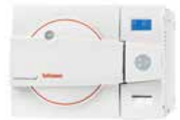
Pre & post vacuum tabletop sterilizers designed to perform class B cycles