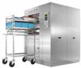
Large sterilizers for various industries and market needs

Featuring Tuttnauer's range of cleaning, disinfection and sterilization solutions