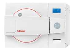
Pre & post vacuum tabletop sterilizers designed to perform class B cycles