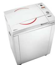
Laboratory autoclaves ranging in size and application