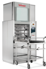
Washer disinfectors for hospitals and laboratories