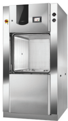
T-Max Line of Large Sterilizers

Featuring Tuttnauer's range of cleaning, disinfection and sterilization solutions