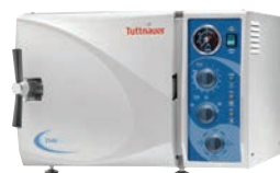
Manual M series