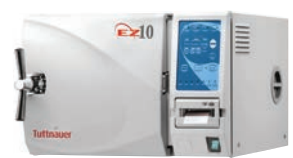
Fully automatic sterilizer