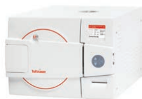
Fully automatic series