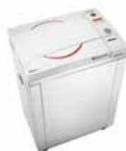
Laboratory autoclaves ranging in size and application