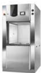
T-Max Line of Large Sterilizers

Featuring Tuttnauer's range of cleaning, disinfection and sterilization solutions