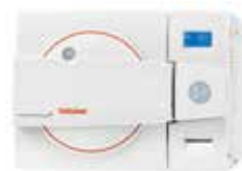
Pre & post vacuum tabletop sterilizers designed to perform class B cycles