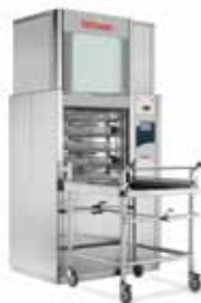
Washer disinfectors for hospitals and laboratories