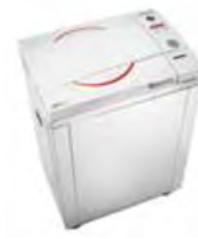
Laboratory autoclaves ranging in size and application