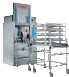
Washers/disinfectors for hospitals and laboratories