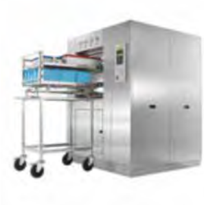
Large sterilizers for various industries and market needs

Featuring Tuttnauer's range of cleaning, disinfection and sterilization solutions