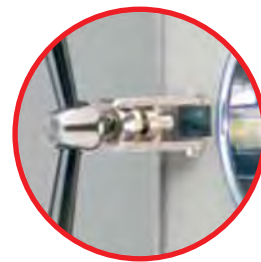
Double locking safety device

Complies with strict international directives and standards: