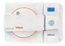
Pre & post vacuum tabletop sterilizers designed to perform class B cycles